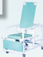
C-SCC260RCFS 400 lb. capacity