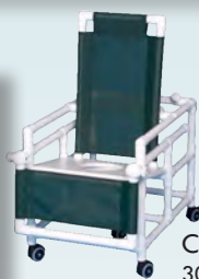
C-SCC250RCFS 300 lb. capacity