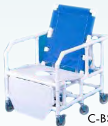
C-BSCC650RCFS 650 lb. capacity