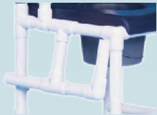
Drop Arm C-LDA (left) C-RDA (right)