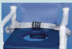
Seat belt C-SCBELT