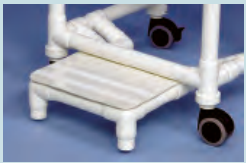
Slideout Footrest C-SCSLFR