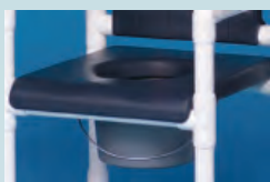
Deluxe Soft Seat C-DSOFTS