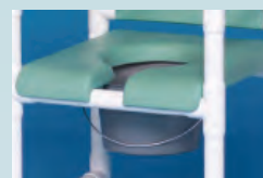
Deluxe Split Seat C-DSS