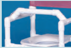
Lap Bar C-SCLAPBAR